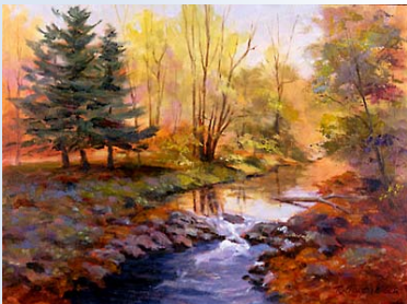
Beaver Creek Autumn