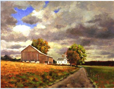
Farm on Union Mill Road