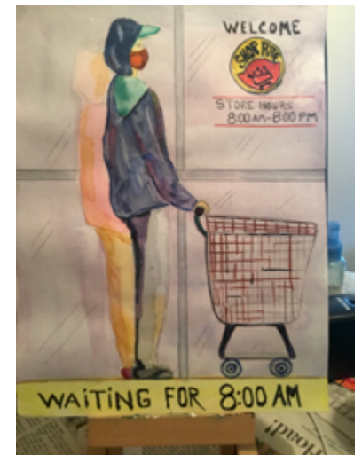
Waiting for 8:00 am by Eugene Kelly