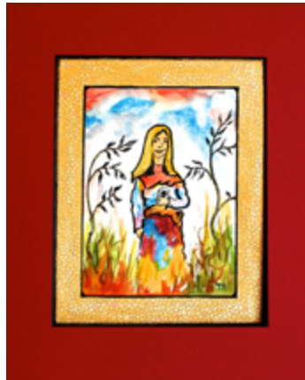
Lady in the Garden