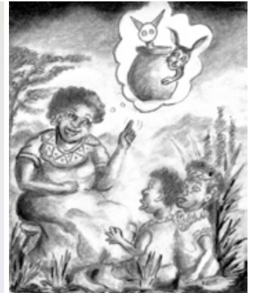
Grandma Tells a Tale

Grandma Tells a Tale 8.5 x 11 inches. Graphite and carbon pencil. This is an illustration for a story I wrote for my grandchildren based on a folk tale.