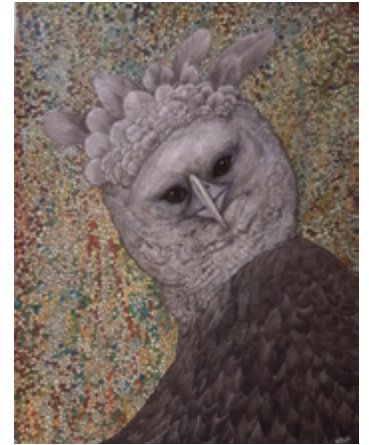
Rare Raptor