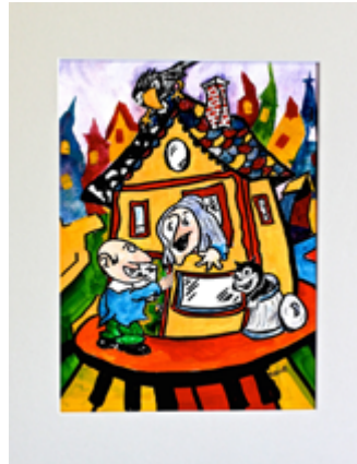
Made for Each Other