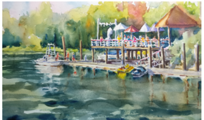
Curtin's Wharf Restaurant Watercolor by Kathy Kellagher

Rules for SOCIAL DISTANCING are to be maintained at all times.