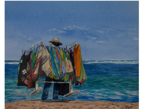
Nordstrom Rack