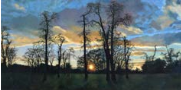
Best of Show Twilight with Broken Trees by Maria Morales