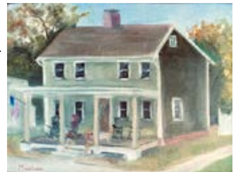
New to the Neighborhood by Sheila Mashaw

Sheila also participated in the the Hightstown Plein Air Show in September which exhibited at Old Hights Brewing Company .