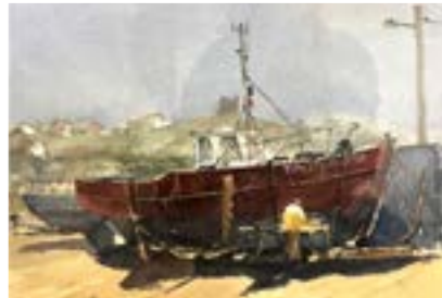
Third Place Boat at Innisbeer