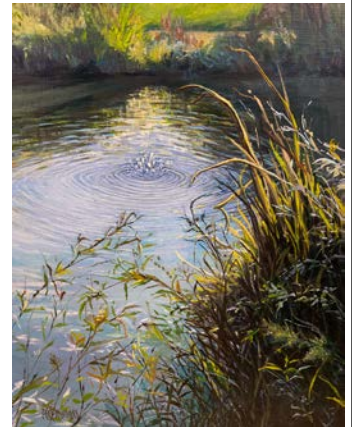
Disruption by Pat Proniewski