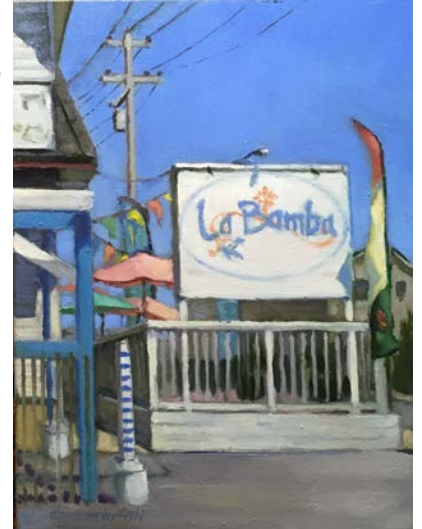
La Bamba and Blue Claw Seafood Market by Dom Martelli