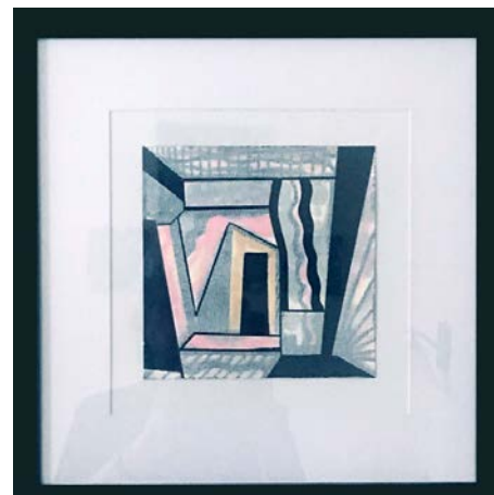
Mixed media art by Ellen Barnett'