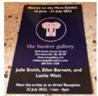
Mixed Media designs by Ellen Barnett

Ellen also created six- 6" x 6" mixed media patterns to experiment with design elements, perhaps on a larger canvas.