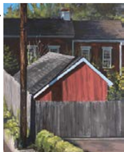
Something to See Between Canal and South Main Streets, Yardley, PA by Pat Proniewski