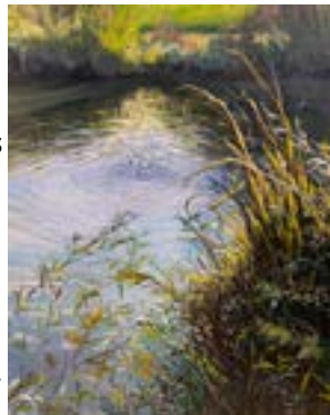
Disruption by Pat Proniewski

Pat is in the Wine Trail and Art exhibit of the Arts & Cultural Council of Bucks County until Oct. 1. There will be wine tastings on September 9-10, from 10 a.m.-5 p.m. Info at www.bucksarts.org/event/bucks-county-wine-art-trail-exhibition-sale-opening-weekend