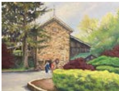
Meet Me at Rose Bank Winery by Pat Proniewski

Pat is in the Wine Trail and Art exhibit of the Arts & Cultural Council of Bucks County until Oct. 1. There will be wine tastings on September 9-10, from 10 a.m.-5 p.m. Info at www.bucksarts.org/event/bucks-county-wine-art-trail-exhibition-sale-opening-weekend