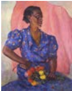
Woman with Bouquet oil on canvas circa 1940