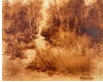
Autumn Tones and Textures by Pat Proniewski