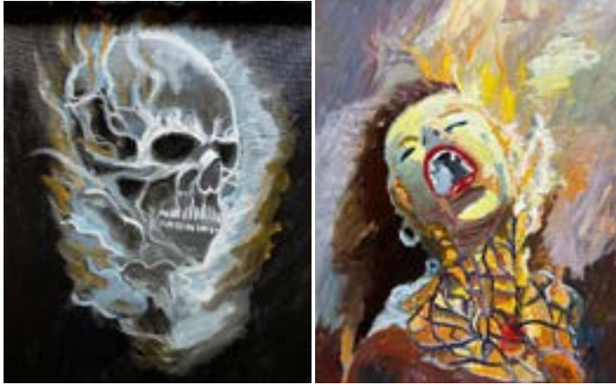
Hello! Is it me you're looking for?