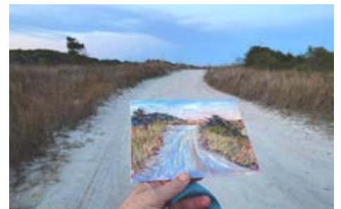
Plein Air Painting by Angelina Smolskis

View Angelina's work at www.instagram.com/angelinaallprimaart